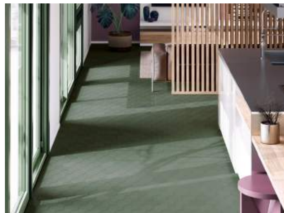
Kromatika Green 11,6 x 10,1 cm / 4½" x 4"