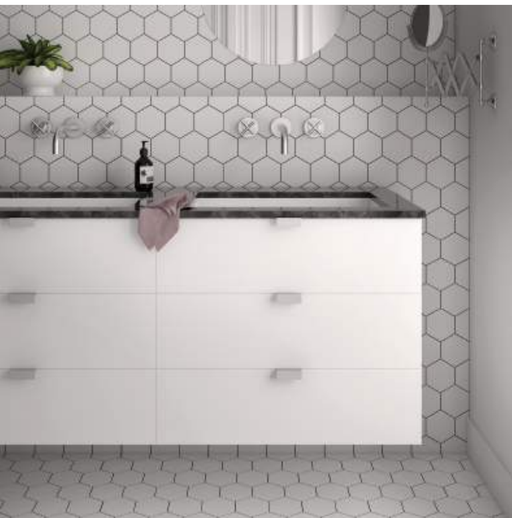
Kromatika White 11,6 x 10,1 cm / 4½" x 4"