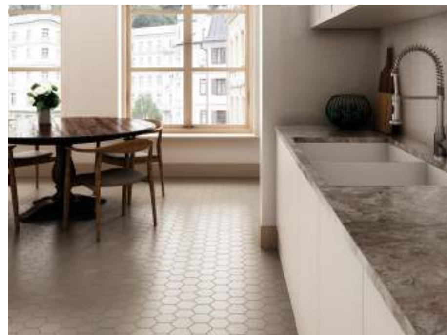
Kromatika Beige 11,6 x 10,1 cm / 4½" x 4"