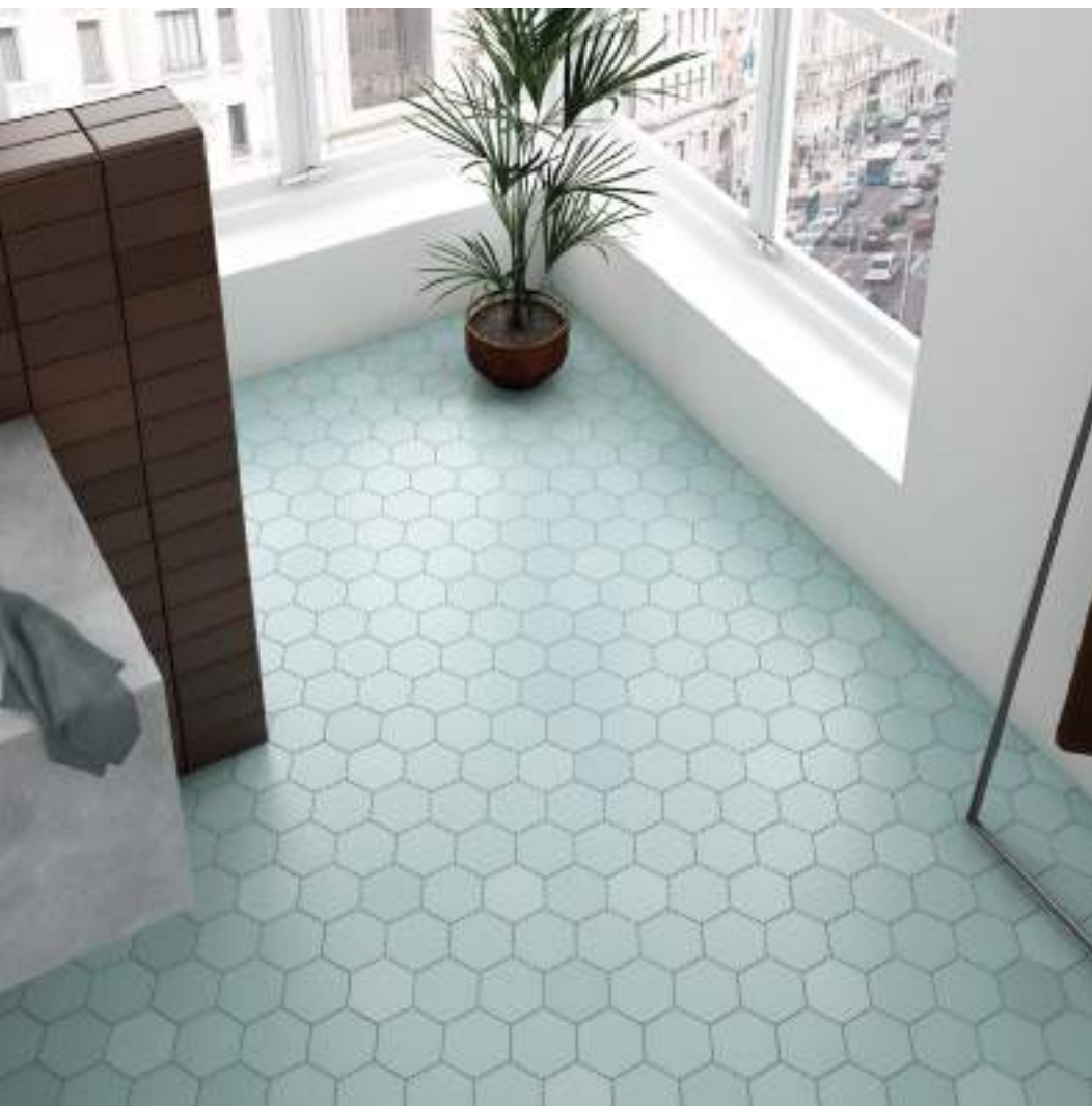
Kromatika Blue Clair 11,6 x 10,1 cm / 4½" x 4"